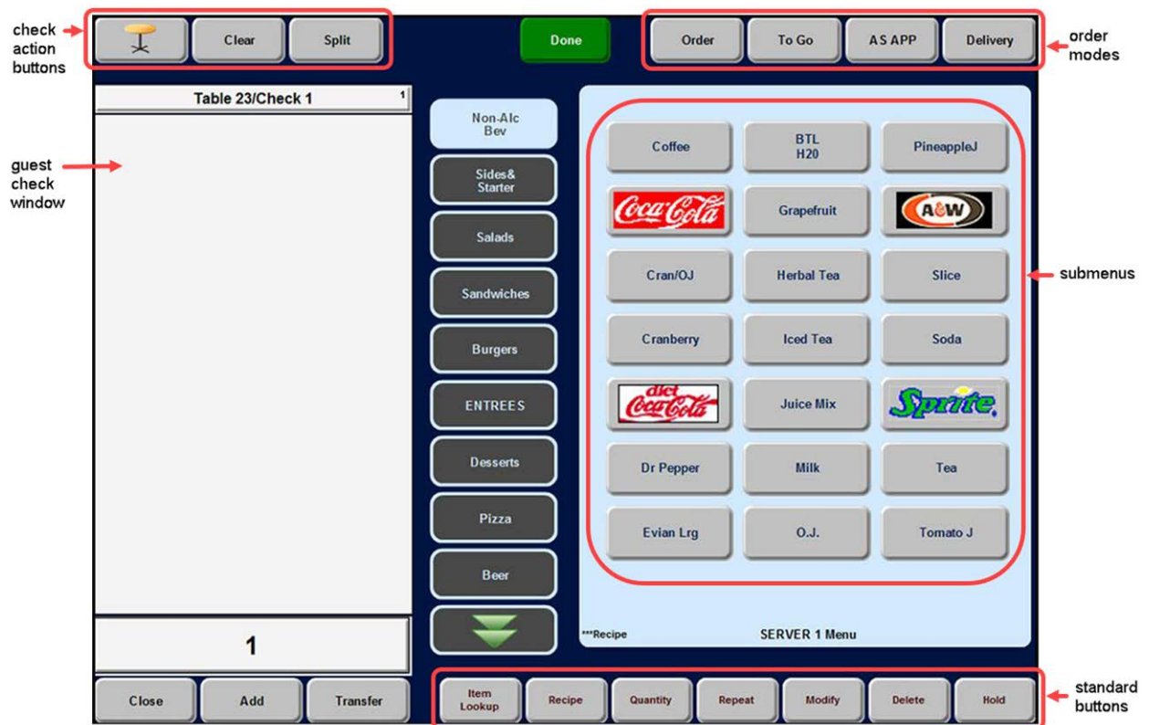
Figure 1 Hard-Coded Order Entry Screen

The Aloha ® Table Service product uses hard-coded screens to maintain familiarity and a consistent screen flow. The hard-coded design of the Table Service order entry screen includes the following areas: